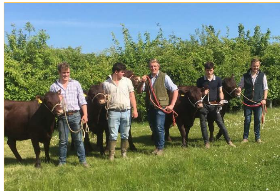
Easton and Otley Show Team