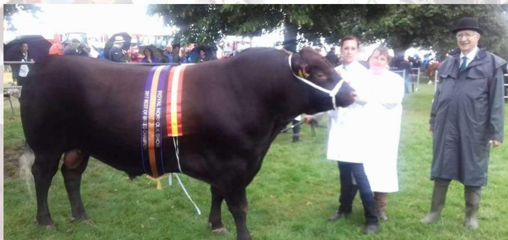
National Show Champion Bull