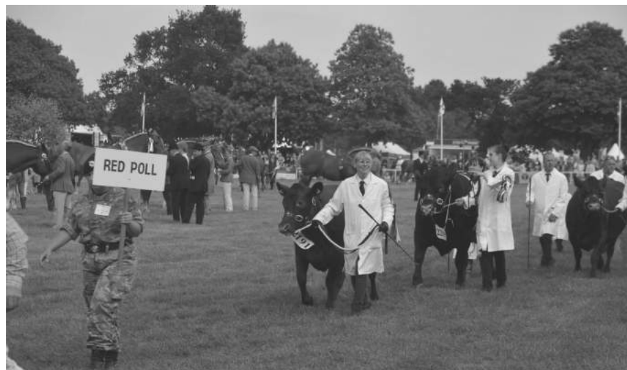
The Grand Parade